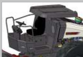
For Ease of Transportation